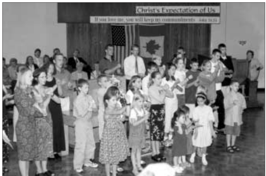
Children and Youth Choir at the 92 nd Convention