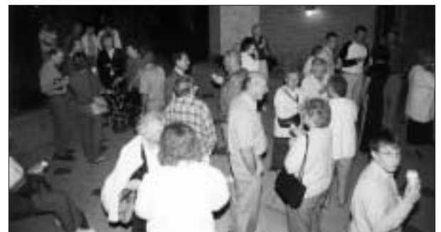
Ice Cream Social