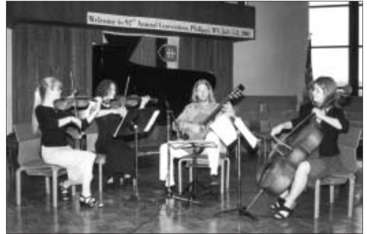
Special Music with:

I think it's a good idea to come out here like a big family and worship God together. It's important to learn about God and what he wants us to do so that we can be better people, and so that afterwards we are confident where we are going in the end. That's why it is good to come here, so that we may invite Jesus into our hearts to be saved