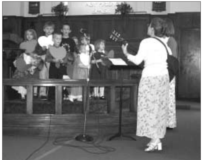
Mother's Day Program