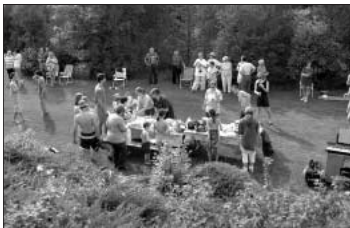
Picnic at Alacs