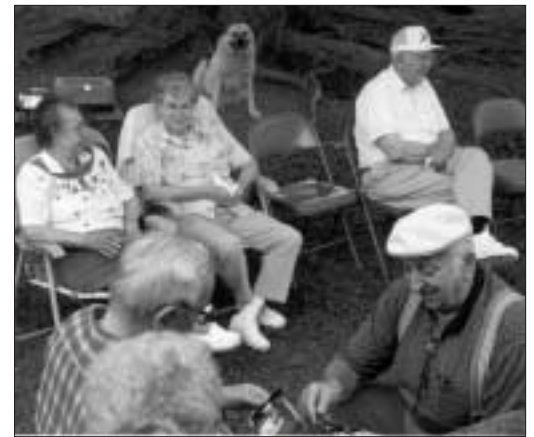
"Obecenstvi" at Sommers - 2