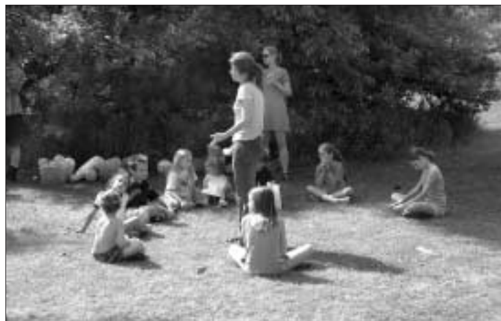
Picnic at Alacs