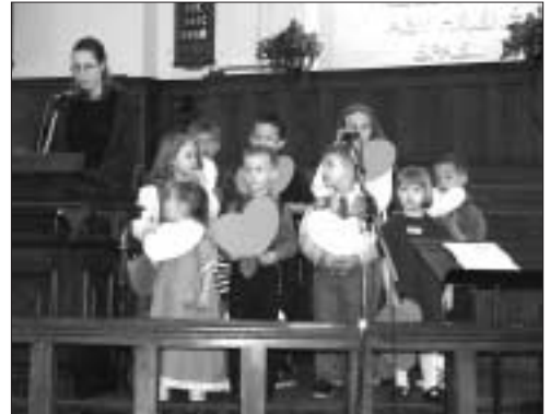
Mother's Day Program