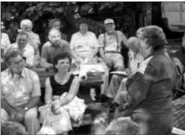
"Obecenstvi" at Sommers - 1