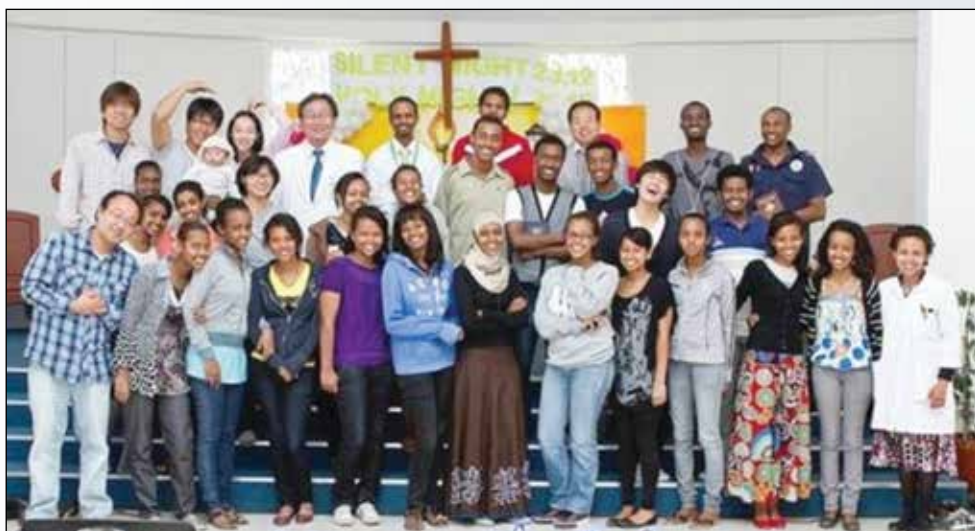
The first class of MyungSung Medical College (before Dan came on board...)