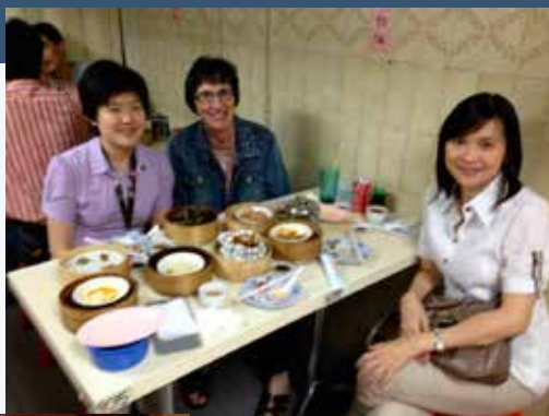
A Singapore feast