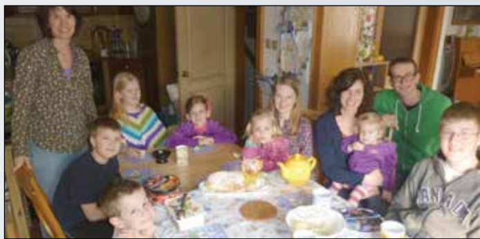
Sharing family times

It's also time to finalize details of our one-month summer ministry trip to