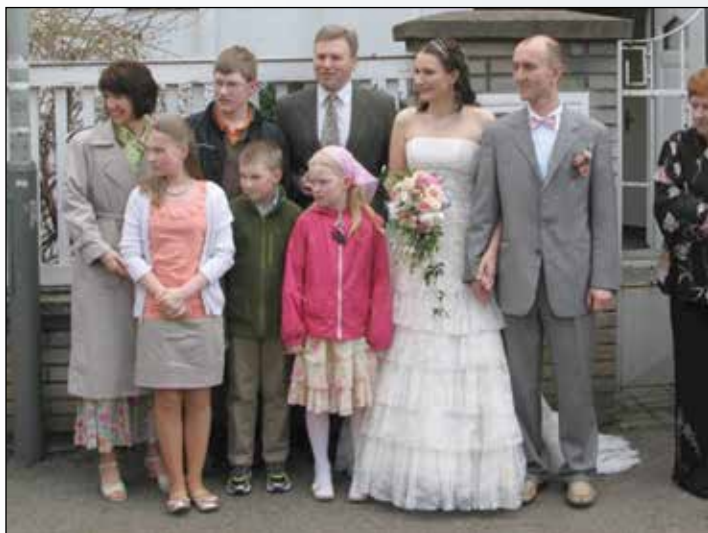
What's that coming down the road?